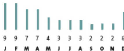
Average rainfall (inches)